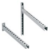
Wall rail support SPWR