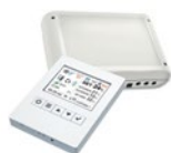
Clever Control Kit